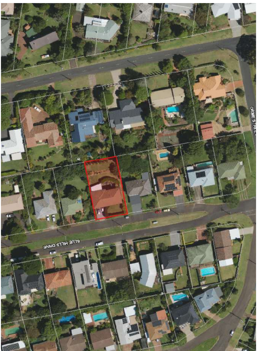
Attachment 1 of 5 Aerial Imagery