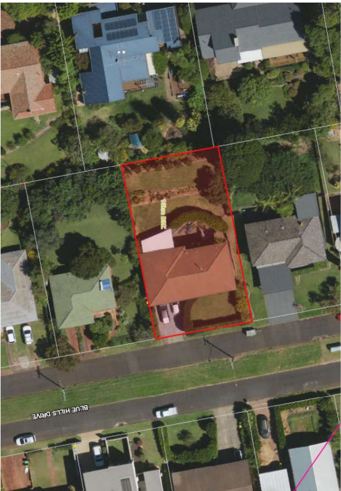
Attachment 3 of 5 Overlay Map