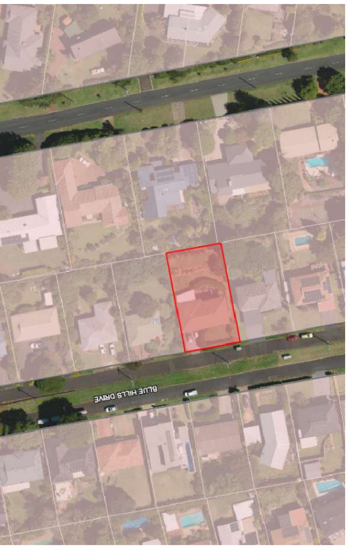
Attachment 2 of 5 Zoning Map