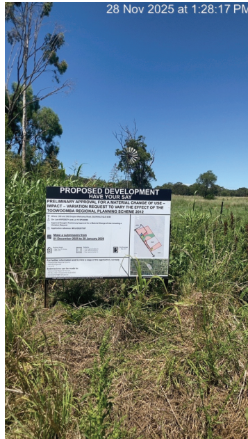
Sign placed along frontage 1