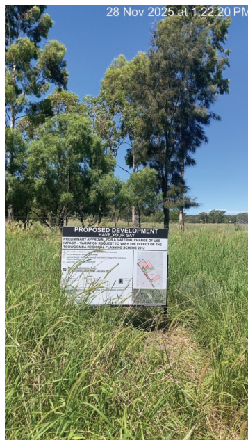
Sign placed along frontage 2