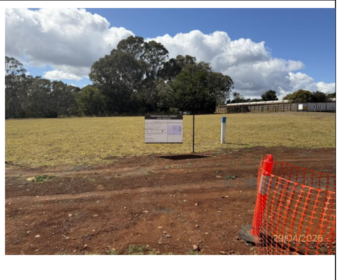
FIGURE 2 – Sign on Guyana Court Frontage - Location