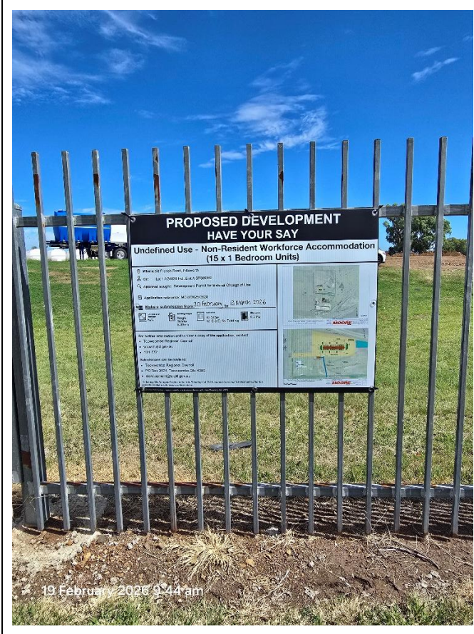
FIGURE 4 – Sign on Gore Highway Frontage - Location