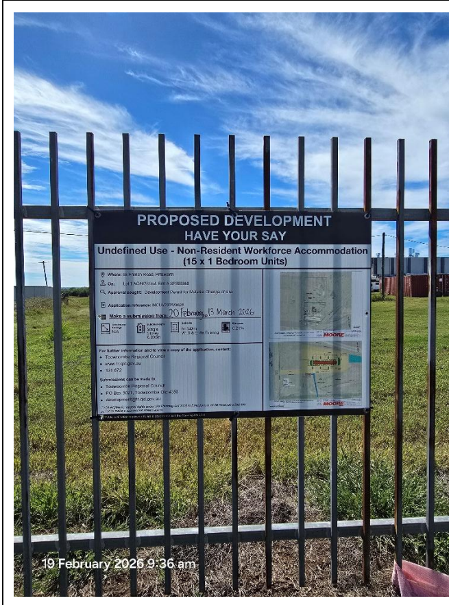
FIGURE 1 – Sign on French Road Frontage - Wording