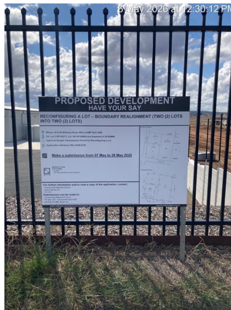
Sign placed along frontage 2