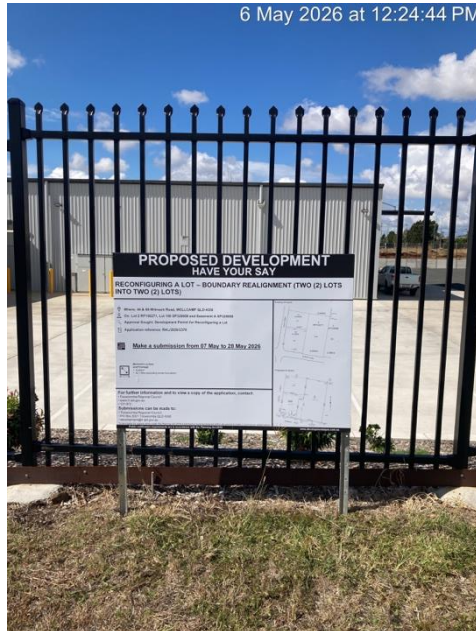
Sign placed along frontage 1